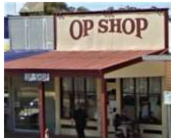
Beaufort Service Group