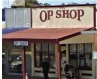
Beaufort Service Group